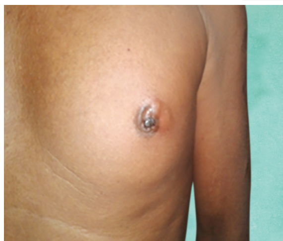
Fig. 1: Swelling of left nipple areola complex with skin involvement

FNAC of left breast showed highly cellular smear with scattered and loosely cohesive clusters of pleomorphic cells showing hyperchromatic nucleus and anisonucleosis. Occasional cells with